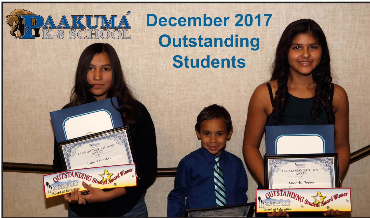
The San Bernardino City Unified School District Board of Education named three Paakuma' K-8 School students as Outstanding Students for December 2017.

SAN BERNARDINO, CA- The San Bernardino City Unified School District Board of Education honored 12 students with an Outstanding Student Award at the December