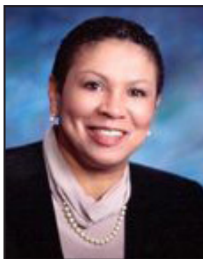
Presented by The Fellas

Monday, February 22 Social Soiree-An Evening of Premier Networking