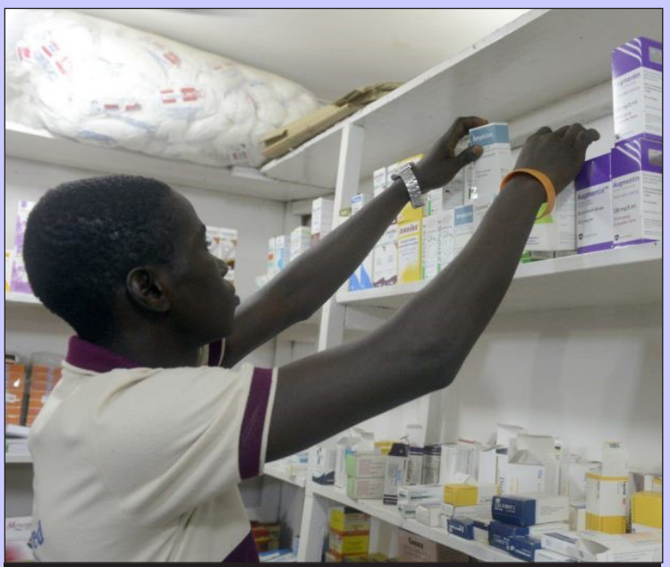
A pharmacist searches for drugs in a pharmacy in Lagos, Nigeria.

Healthy competition from generic drugs is often held up as a "cure" for high drug prices — a shared concern across rich and developing countries alike. For many low- and middle-income countries, however, a new report from the Center for Global Development that we co-authored shows that global markets for generic medicines are failing, leaving the poorest patients without safe and affordable essential medicines.