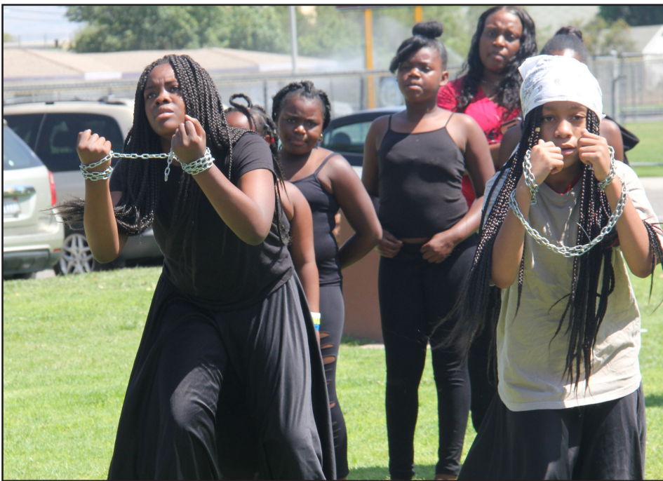
Akoma Center Youth performed a dramatic program 'From chains to FREEDOM'

(EMPIRE NEWS NETWORK (ENN)-SAN BERNARDINO, CA- On Saturday, June 16, at Anne Shirrells Park, the City of San Bernardino held its 4th Annual Juneteenth Freedom Festival. (To view more photos, please visit www.wssnews.com ).