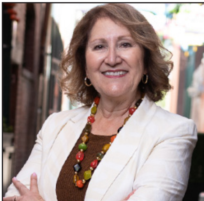
Senator Eloise Gómez Reyes (D-Colton)

SACRAMENTO, CA -- Senator Eloise Gómez Reyes (D-Colton) in partnership with the City of Rancho Cucamonga has introduced legislation to ensure community safety on freeway overpasses in San Bernardino County.